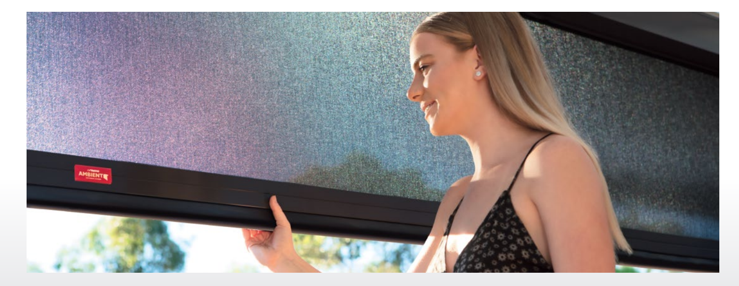
SPLASH PROTECTION REGENT with 5% openness fabric in 'Champagne' colour with headbox and crank driven action